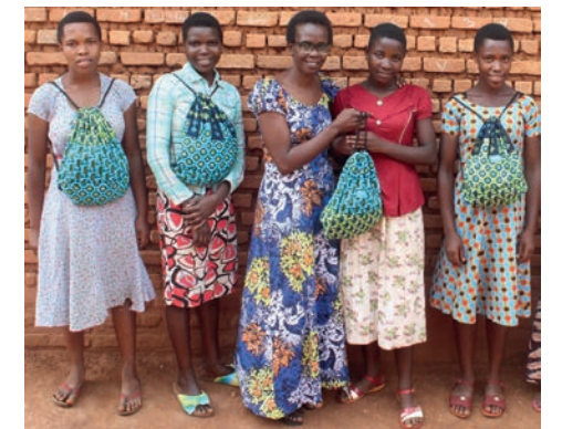
Young women receive Wunders kits

Family projects are small projects that help both parents and children. They include small business, agriculture and livestock projects. When a child attends the program, it benefits the entire family, diminishing financial insecurity and equipping the parents with sustainable income. They are taught to grow rice, beans, corn, avocados, pineapples, sugar cane, and more. For livestock, they are provided with pigs, goats, rabbits or chickens. These projects are transformative in many families lives.