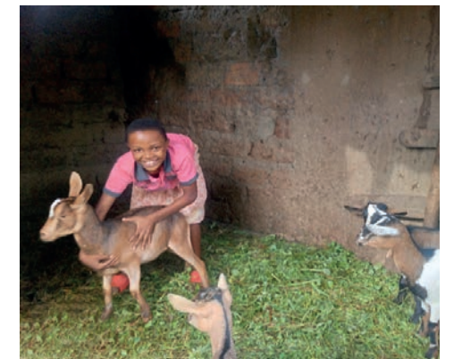
Playing with the goats

Each of these projects is very important to our children's holistic development. Cost of living has been rising in Burundi over the last year, making it even more difficult for many families to provide their children with education. We are seeing the impact of when a child is sponsored- it helps the child, their family, the church, and eventually even the country! VBS and Youth Bible Camp teachings are encouraging children and young people to stay in school and build their bright futures. We are very grateful for the ICCM Support and prayers, and we are hopeful for the future. Thank you to the sponsors for putting a smile on the children's faces. May God bless you!