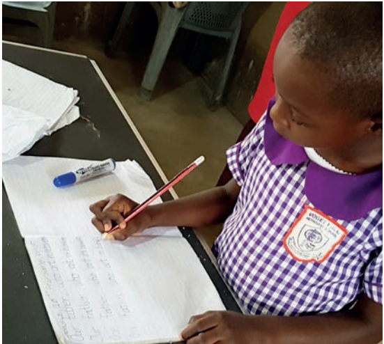
A Student copies lines from the Lord’s Prayer

At the close of the 2023/24 academic year, the Parent/Teacher Association and management of the school resolved to start the Junior High School program for the new year, using the Church auditorium as a classroom. The school has reopened and the required teaching staff have been employed. Reports reaching the school management from parents whose children had to be sent to other schools for lack of classrooms are positive. These students are continuing to excel academically, and their new teachers are impressed by their exemplary behaviour. The school has much positive impact in the community. The relatively low fees paid and the flexible mode of payment compared to other schools in the area lessens parents’ financial burden. People in the community are happy for the existence of the school, as the students and the staff patronize the