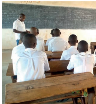
Pupils in the secondary school class