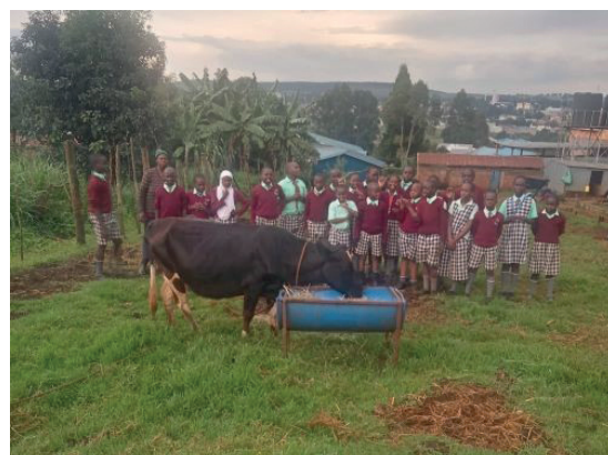
Students pose for a photo with one of the cows

We can't forget to acknowledge another benefit provided by these cows, which is the production