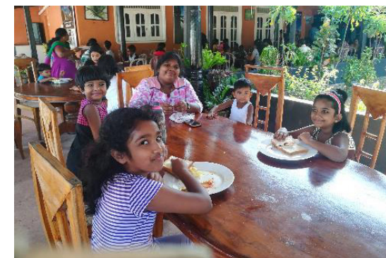
Top row images— highlights from this year's school and summer camp programs in Sri Lanka