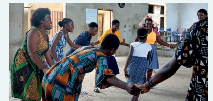
The community circle learning activity

health kits, which are then distributed at ICCM and Free Methodist World Missions connected schools and churches, as well as other locations such as teen pregnancy centers and women's conferences.