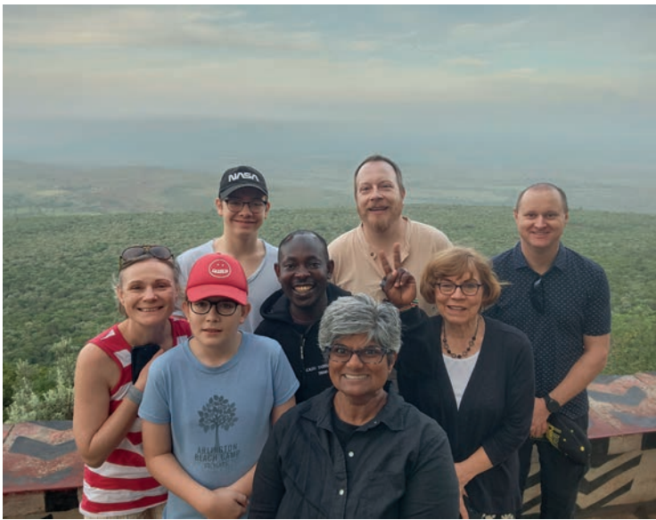
Visiting the Rift Valley