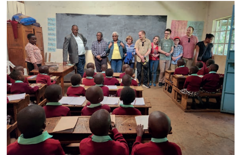
The team visits a classroom