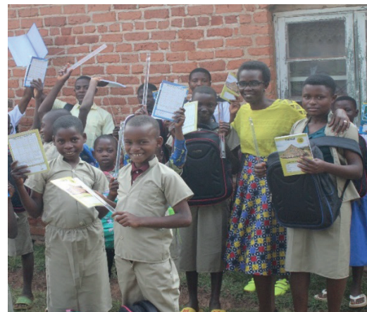
Children receive school materials