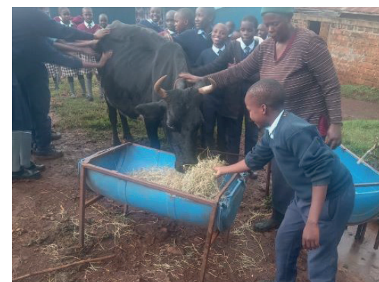
A student adds feed to the cow's trough

In Kenya, tea is a very popular drink, especially to be taken during breakfast and brunch. Kericho, where the school is located, is home to many