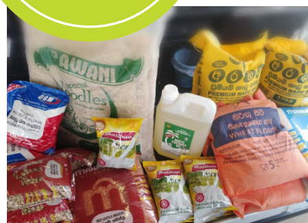
Grocery items that are distributed