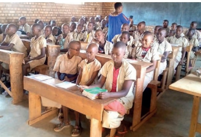
Pupils attend class at the primary school