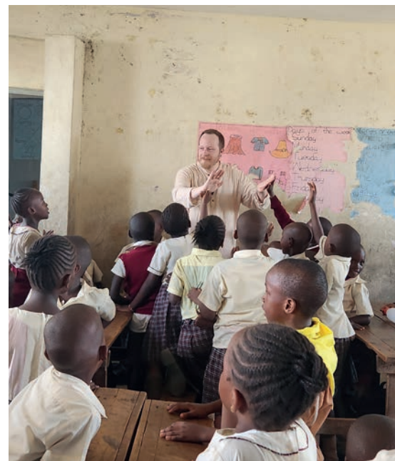
Praying with Kenya alumni