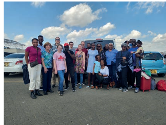
Encounter Kenya team meets ICCM Kenya staff