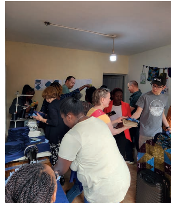
Helping to assemble Wunders kits

Encounter trips are a unique way to experience the impact of ICCM's mission in a specific country. Touring schools, meeting sponsored children, and fellowshiping with local believers are just a few of the opportunities the team had during Encounter Kenya in 2024!