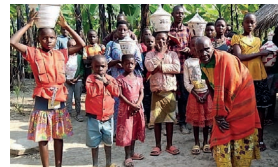
Helping an elderly widow

Children receive Busoma Porridge to bring home each quarter. The locally produced blend of corn, soybeans, and sorghum is both delicious and highly nutritious.