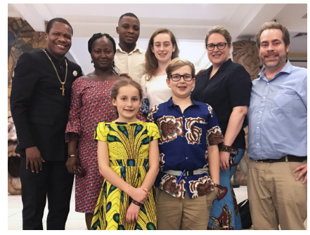
THE MCLAGAN FAMILY IN GHANA

More importantly, we stepped into a reality that was filled with rich beauty, and tragic pain.