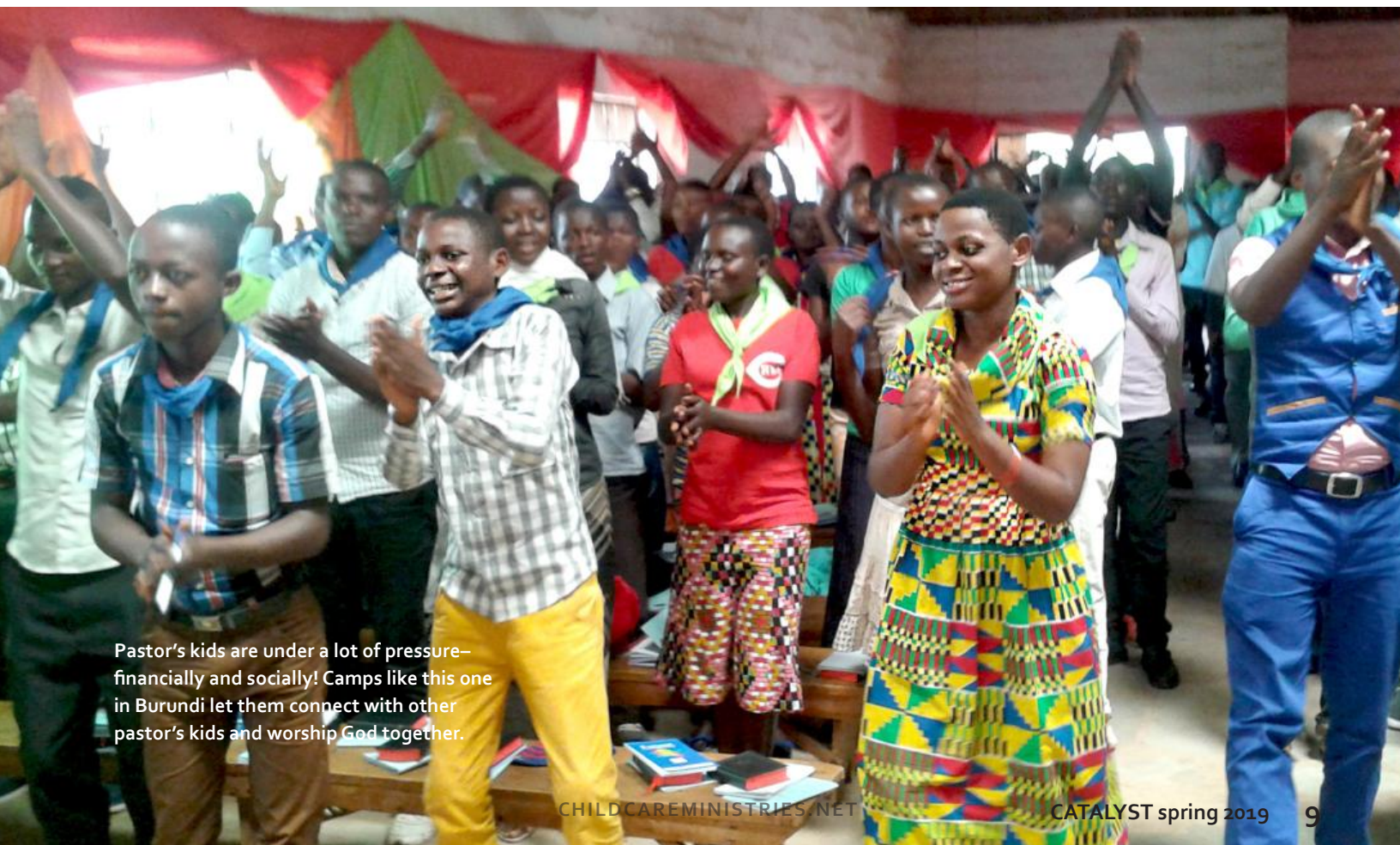
Pastor's kids are under a lot of pressure—financially and socially! Camps like this one in Burundi let them connect with other pastor's kids and worship God together.

Fortunately, she was saved by her other relatives from this arranged marriage and was brought to our hostel. Now she is a proud grade 7 student cherishing every moment of her stay in our residential care systems. She can focus on her education and development like all teens should be able to! Children like her who have experienced the impact of sponsorship are creating a ripple effect on other children.