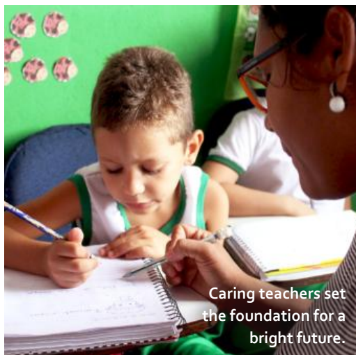
Caring teachers set the foundation for a bright future.

Despite their hardships and poverty, the center has made a huge difference in their lives; there they know they are well-loved and have been given many opportunities for development.