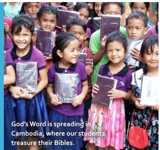
God's Word is spreading in Cambodia, where our students treasure their Bibles.

Investing in a young child is like a pebble cast on the water – its ripples stretch to an ever-widening circle.