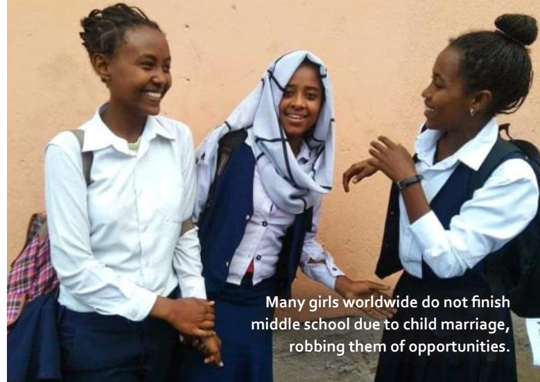
Many girls worldwide do not finish middle school due to child marriage, robbing them of opportunities.

In one of our hostels, a girl lost both of her parents and was placed under the care of her grandmother, the only person who could provide shelter for this girl. Burdened with the societal pressure and the economic