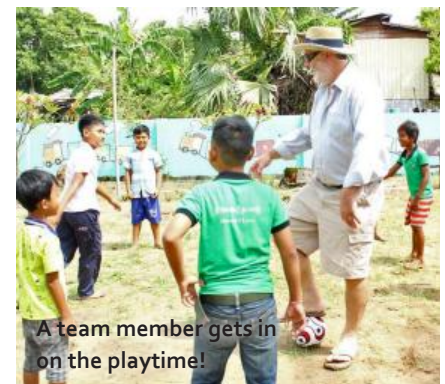
A team member gets in on the playtime!